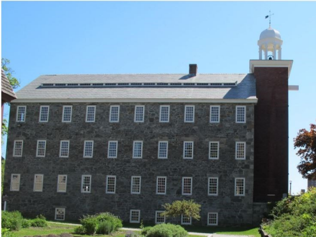
Wilkinson Mill at the Slater Mill Site in the Blackstone River Valley NHP

Blackstone River Valley National Historical Park