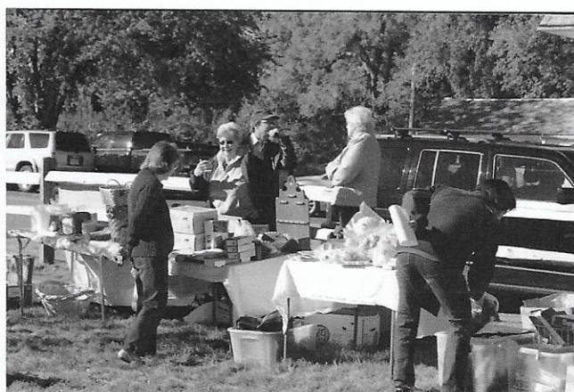
Society Members hard at work at the Yard Sale.