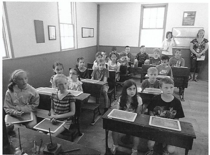
3rd Grade students in Eight Lots School House