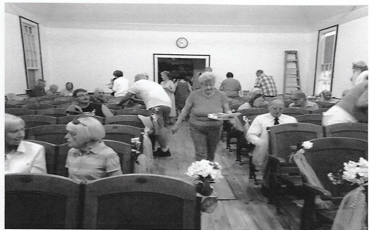
Above: Interior of First Baptist Church, Manchaug Left: Cookout/Potluck Picnic