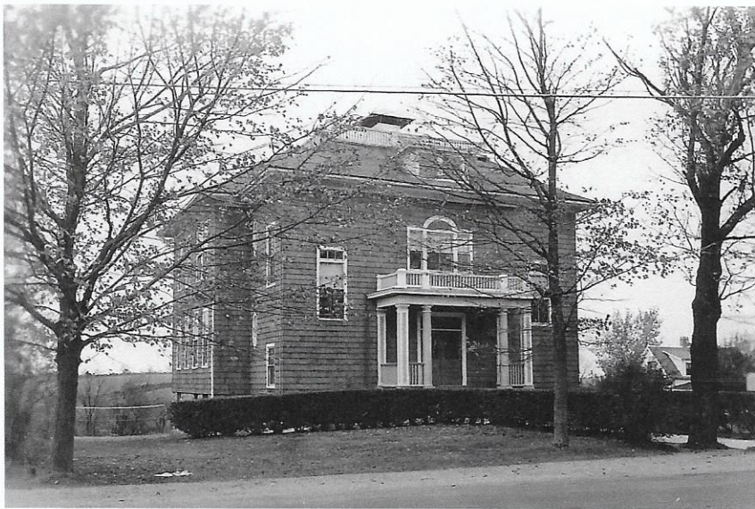
Old Sutton High School, Singletary Ave

Some memories fade, while others remain crystal clear- so it is with my impressions of Sutton High School, 1947 - 1951.