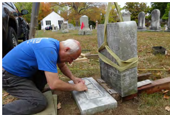
4. Monument compound is applied to base.