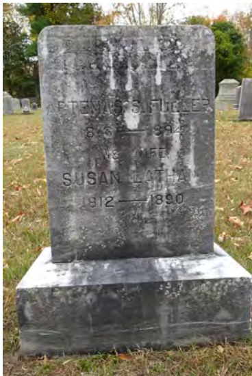
1. Artemas Fuller monument is leaning and ready to slide off the base.

Resetting Artemas Fuller monument, Harmony Cemetery, Gloucester