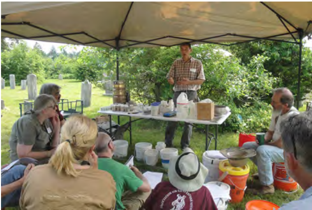
AGS conservation workshop, Monmouth, NJ 2012

“fix” them. If you would like to do gravestone conservation work in a cemetery, it is strongly advised to get training. The best way is to join the Association for Gravestone Studies and attend one of their conferences. A gravestone conservation workshop is part the conference. This is a great opportunity to get hands-on training and learn from the experts so that you learn the correct methods and best materials. The conference is held in June each year in a different state in the country.