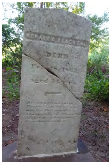
Epoxy repair is complete

Epoxy repair of Horace Keach gravestone, Cemetery #105 Burrillville. Marble stone is very weathered.