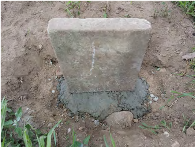
Setting a gravestone into a wet pool of concrete is harmful to the stone.

Listed below are Improper Repairs. These techniques are harmful to the stone.