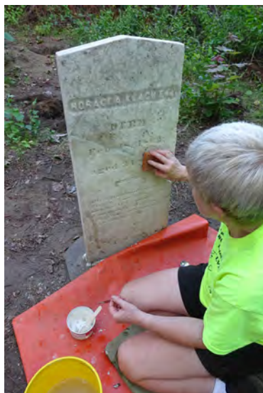
Applying Lithomex to crack