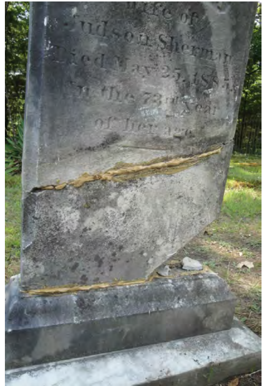
Unskillful use of caulks that don't adhere properly and repair fails,