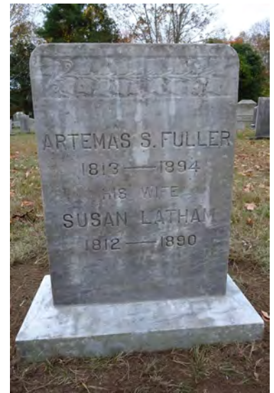
7. Artemas Fuller monument is done.

Broken Headstones. Broken headstones can be repaired using special epoxies. We recommend the use of a product made by Akemi called Akepox 2030. It can be purchased at Stone Boss Industries in New York. DO NOT use any adhesives or epoxies from local hardware stores as they are NOT appropriate for gravestones! First you should make sure you have found all the pieces and they are clean. You should dry-fit them together to make sure they fit. As an example, let's assume that a tablet is broken in two. The bottom piece can be set into the ground to the proper depth. Once that is set, the top piece can be epoxied to the bottom piece. Great care should be taken in the proper mixing and application; a thin film is all that is needed. DO NOT apply to the edges of the stone. NONE of the epoxy should ever ooze out. The top piece can be held to the bottom piece with the use of two pieces of wood positioned vertically held by two wood clamps on either side. If it is very warm in the summer, the epoxy will set quickly, it takes longer when it's cooler. These repairs are best done in the summer when it's warm.