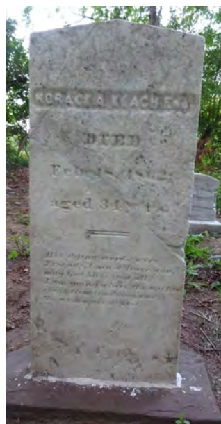
Repair is complete.