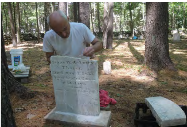
The bottom piece is level and has been set. Then epoxy is applied and the two pieces are joined. They are then clamped together

Broken Headstones. Broken headstones can be repaired using special epoxies. We recommend the use of a product made by Akemi called Akepox 2030. It can be purchased at Stone Boss Industries in New York. DO NOT use any adhesives or epoxies from local hardware stores as they are NOT appropriate for gravestones! First you should make sure you have found all the pieces and they are clean. You should dry-fit them together to make sure they fit. As an example, let's assume that a tablet is broken in two. The bottom piece can be set into the ground to the proper depth. Once that is set, the top piece can be epoxied to the bottom piece. Great care should be taken in the proper mixing and application; a thin film is all that is needed. DO NOT apply to the edges of the stone. NONE of the epoxy should ever ooze out. The top piece can be held to the bottom piece with the use of two pieces of wood positioned vertically held by two wood clamps on either side. If it is very warm in the summer, the epoxy will set quickly, it takes longer when it's cooler. These repairs are best done in the summer when it's warm.