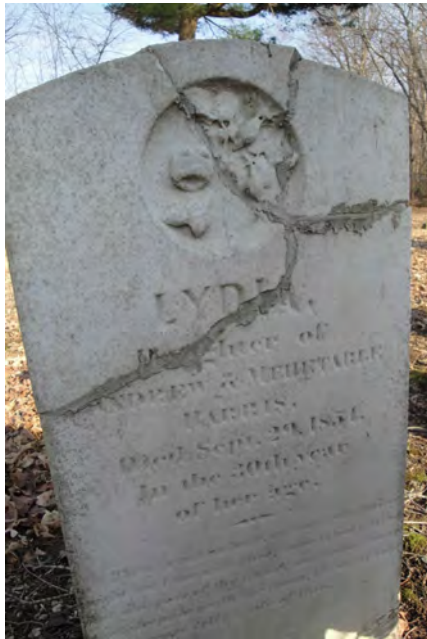
Use of hard Portland mortar to repair broken stone. Careless application obliterates some of the inscription. It is impossible to repair this stone correctly because this Portland mortar can NEVER be removed!