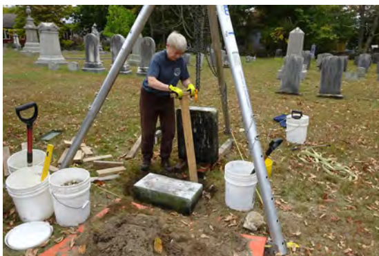
3. Base is set at proper height.