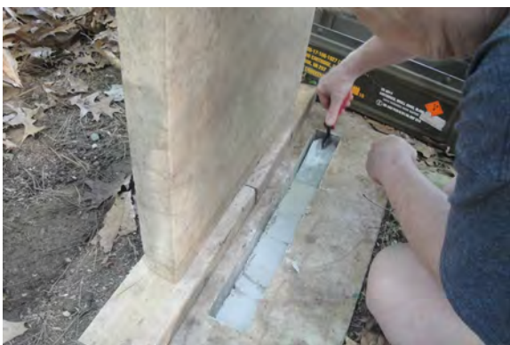
Applying high lime mortar inside slot of a base. Cemetery #29, Burrillville