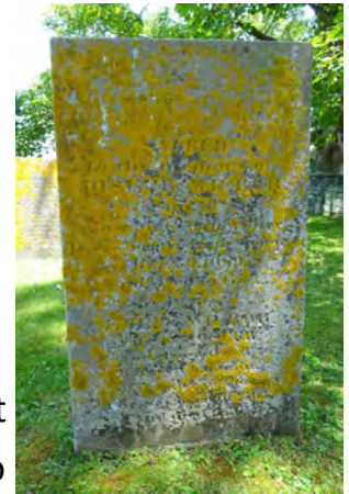
Wilbor Cemetery, Little Compton

People concerned with the preservation of historical cemeteries do not like to see gravestones that are broken, leaning or damaged and want to