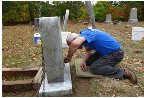
6. Monument compound is trimmed.