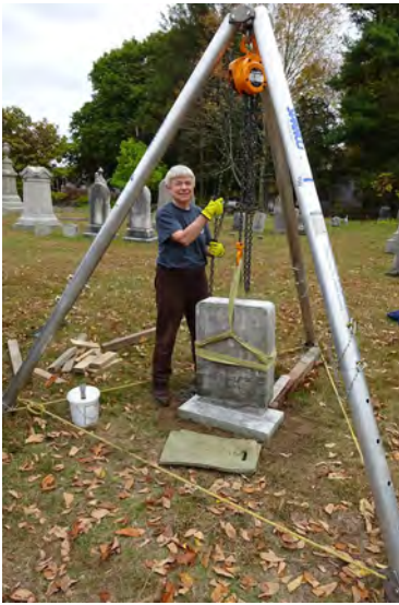
5. Monument is set onto base with tripod