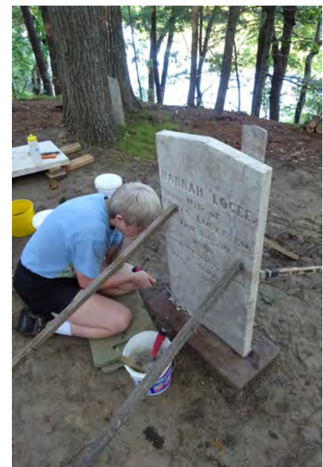
Applying high lime mortar to fasten gravestone to base. Cemetery #93