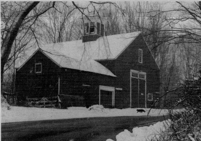
Photo of the Joshua Armsby, Jr. Barn, Sutton, MA Built 1830 Razed 2005

The barn's destruction marked the loss of one of the last visual reminders that Armsby Road was once part of a thriving 19 th -century farm complex. Even the indignity of Route 146 bisecting the property in the 1950s had taken less of a toll on the area's pastoral character. So long as the barn remained, one could still wander up Armsby Road and with a mere glimpse of its weathered exterior recall an older, simpler way of life.