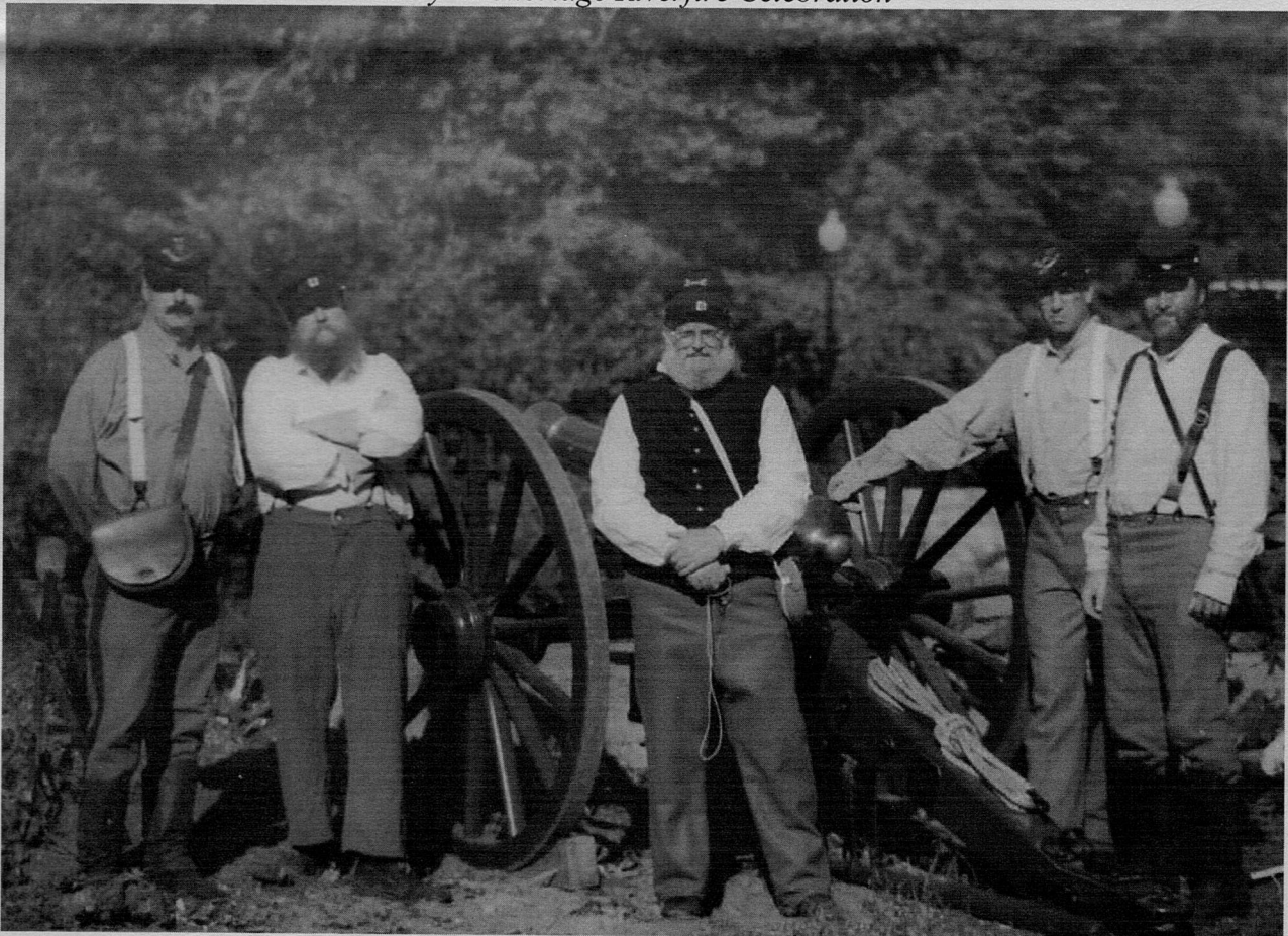
Sutton Artillery at Uxbridge Riverfire Celebration