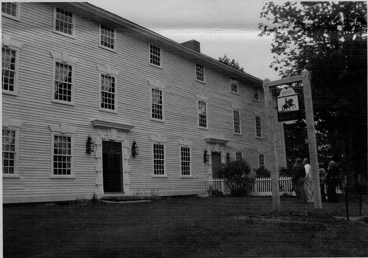
The front of the Rider Tavern with the Sutton and Charlton Historical Societies.

Photograph of the sign in the third floor attic explaining a small part of the history of the Rider Tavern. The attic has a raised roof, but the original roof was flat and had a rooftop garden, unusual for the time. The roof was blown off in the Hurricane of 1938.