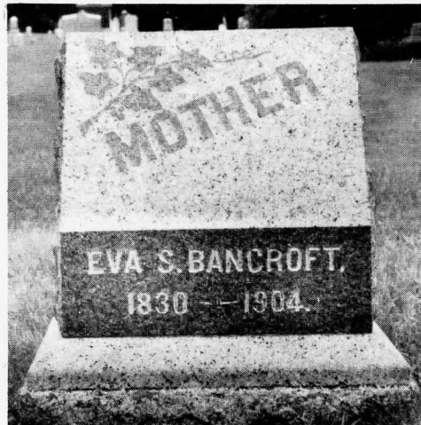
HOWARD CEMETERY SUTTON, MASSACHUSETTS

THUS ENDS A VIVID AND DRAMATIC FIRST PERSON STORY OF WAGONEERING IN THE WEST